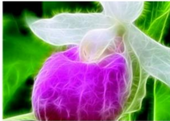
Spectacular Showy Pink and White Lady Slipper

Information excerpted with some modifications from Wikipedia.